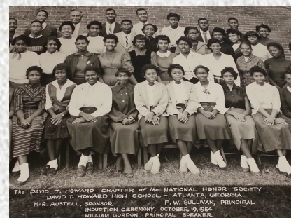
The museum display includes dozens of photographs of APS buildings, faculty, administrators and alumni. Of note are class photos and shots of students in action.

To schedule a tour or research appointment, contact staff at (404) 802-2200 or archives@atlanta.k12.ga.us