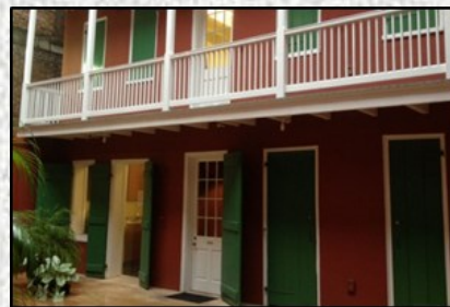
An old building converted into offices for the staff of the Williams Research Center.

I flew in to New Orleans early Tuesday morning and headed straight to the venue of the Research Forum with my luggage in tow. Initially I was not sure what to expect given the displayed posters and scheduled presentations. I was fortunate that I came in around the morning break so I inconspicuously blended myself with the participants. The posters allowed me to gain a quick overview of what archivists and archives students are interested in investigating given their contexts. Out of the twenty posters, a couple of titles caught my interest: Examining Personal Digital Photo Management and Archiving Strategies and Using Social Media to Connect Users to Digital Archives . Both of these posters were completed by graduate students like me. I was encouraged of what I might pursue for future projects. I also was engaged in one of the presentations of a faculty member from the University of Maryland titled, Archival Dispersion and Virtual Reunification: Toward a Framework for Representing the Complexities and Dimensions of Dispersion . I thought that the idea of reunifying various pieces of related archival collections is much more possible using the Web instead of relocating them physically. At the end of the day, I bravely ventured out to one of the social gatherings at a local place and met other conference attendees. It was a good way to end the day and I was invited to listen to jazz music across town.