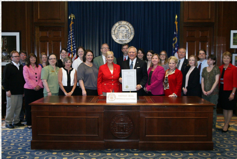
Governor of Georgia, Nathan Deal, and his wife, Sandra, pose with archives supporters after the signing of the proclamation declaring October 2013 Georgia Archives Month, September 10., 2013.