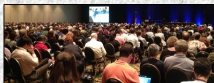
Waiting for the first plenary session at Archives 2013.

This was my first time to attend the SAA annual conference. I have been involved with SGA since I started my graduate program in 2011 and completed its mentoring program the year before. I received helpful advice from several SGA members and received more information from those who participated in a research project I conducted recently.