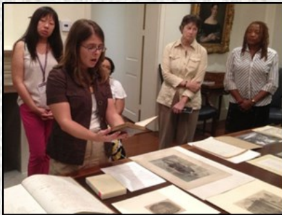
Williams Research Center staff describing an artifact from the collection.

up for an early afternoon scheduled tour of the Historic New Orleans Collection (HNOC) Repository at the Williams Research Center, sponsored by the Archivists and Archives of Color Roundtable. Initially I was not looking forward to the tour because I was soaking wet from the rain on my way to the Williams Research Center. However, I am glad that I stayed and learned more about the contributions of people of color to New Orleans. After the tour, I hastily changed to dry clothes and visited several ongoing roundtable meetings including the Archives and Archivists of Color and International Archival Affairs. I attended the SAA New Member/First-Timer Orientation. Again, I met several new acquaintances and one of them works for The Ohio State