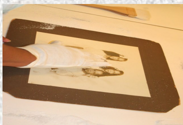
Archives staff clean a photograph during a workshop with the Conservation Center for Art & Historic Artifacts.

Few research centers rival the breadth and depth of the Archives Research Center. To make use of the incredible range of collections and materials, please contact the staff at (404) 978-2052 or archives@aucr.edu .