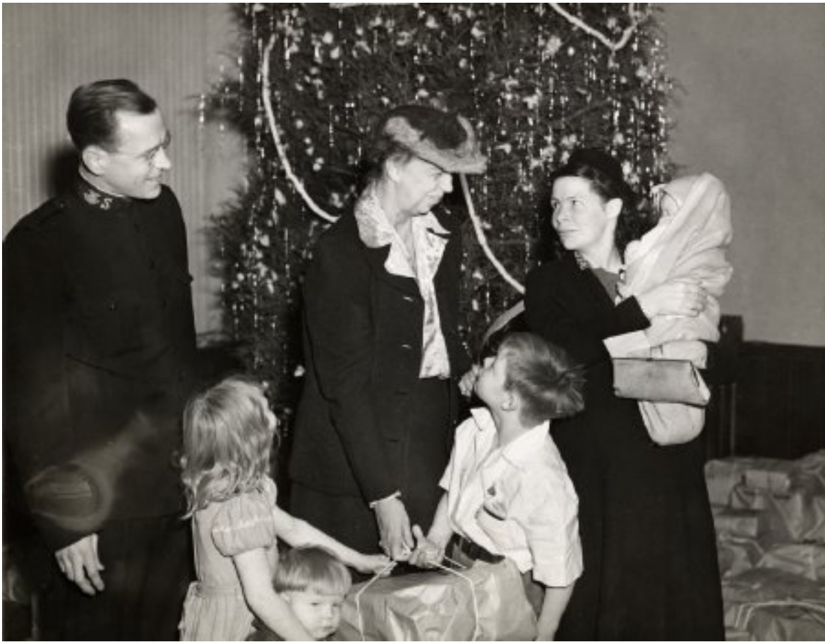
First Lady, Eleanor Roosevelt, distributing Christmas baskets at The Salvation Army corps hall, Washington, DC , about 1943; #1990.0102.23