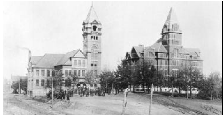
Tech Tower prior to 1892.

Spotlight: Georgia Tech Photograph Collection http://video.library.gatech.edu/gtpcfiles/gtpc.html