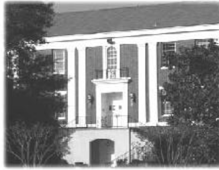
Willet Memorial Library.

Because the archives chronicle the history of Wesleyan, major collections include official papers of the college. These collections include items of historical interest to the college, such as photographs, diplomas, essays, books, faculty publications, programs, and clothing.